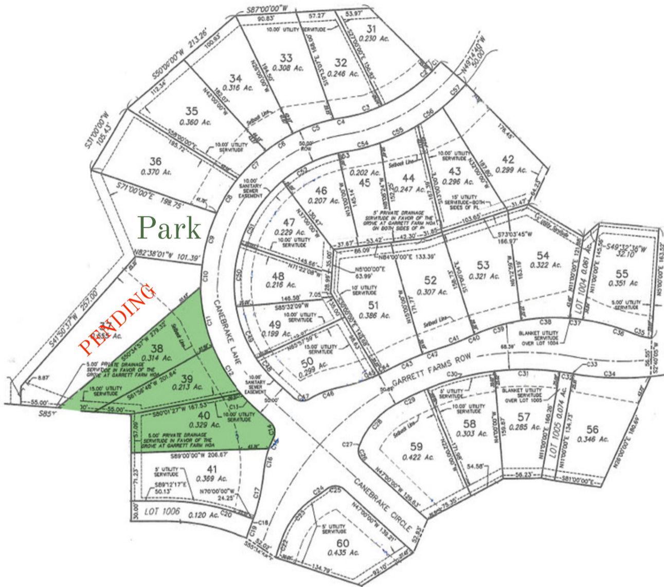
Phase 1 Lot 1